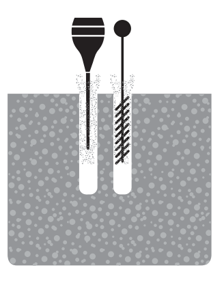
2. Blow and clean Clean the drill hole completely of dust and debris. Use blow pump and brush

1. Drilling Use drill in hammer mode. Drill to specified diameter and depth for the required size.